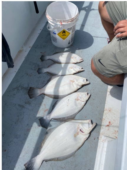
The catch minus the seabass and Ling