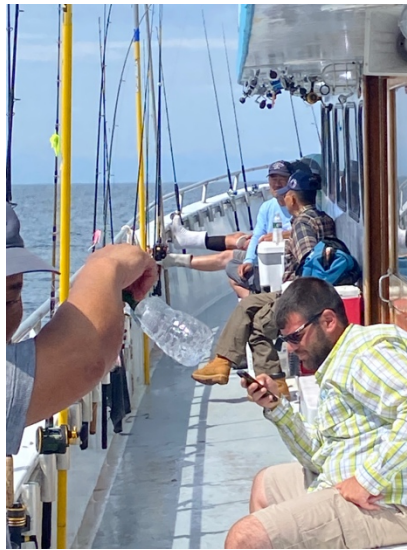
Friendly group of fishermen not crowded with 45 on board