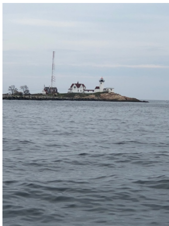
Tuna.com (Wicked Tuna)